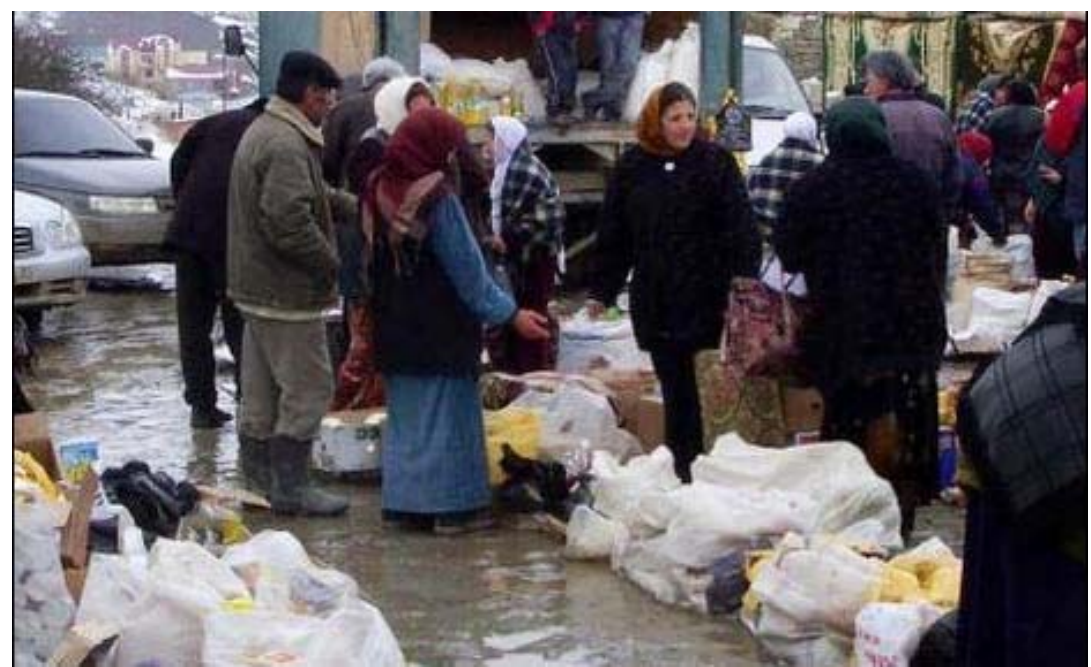
Market in Dagestan

tax credits and tax exemptions for small businesses. A green agenda is even outlined, with the author foreseeing the new government saving money by switching to alternative sources of energy such as wind and solar power. It is also proposed that Dagestan should make use of more traditional economic assets. The economic importance of the Caspian Sea is outlined; the possibility of exporting agricultural produce is discussed; and the sale of electrical power to neighbouring jurisdictions is envisaged as a means of swelling the state coffers. Taken at face value, this treatise contains a sensible strategy for instituting Dagestan's economic sovereignty within the context of a new Islamic state in the Northern Caucasus. The article runs to less than nine hundred words, however, and contains too many assumptions about social and economic realities in Dagestan to be in any way regarded as Prophetic.