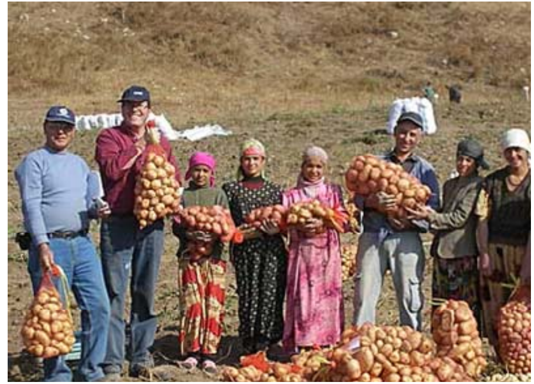
(International Potato Center)

Food security, alleviating poverty and an environmentally sound use of natural resources are vital to sustainable economic growth in Central Asia. The problem is that food insecurity in Central Asia is chronic, not temporary. A combination of internal and external shocks, including harsh winters, droughts, a locust invasion, and supply cuts