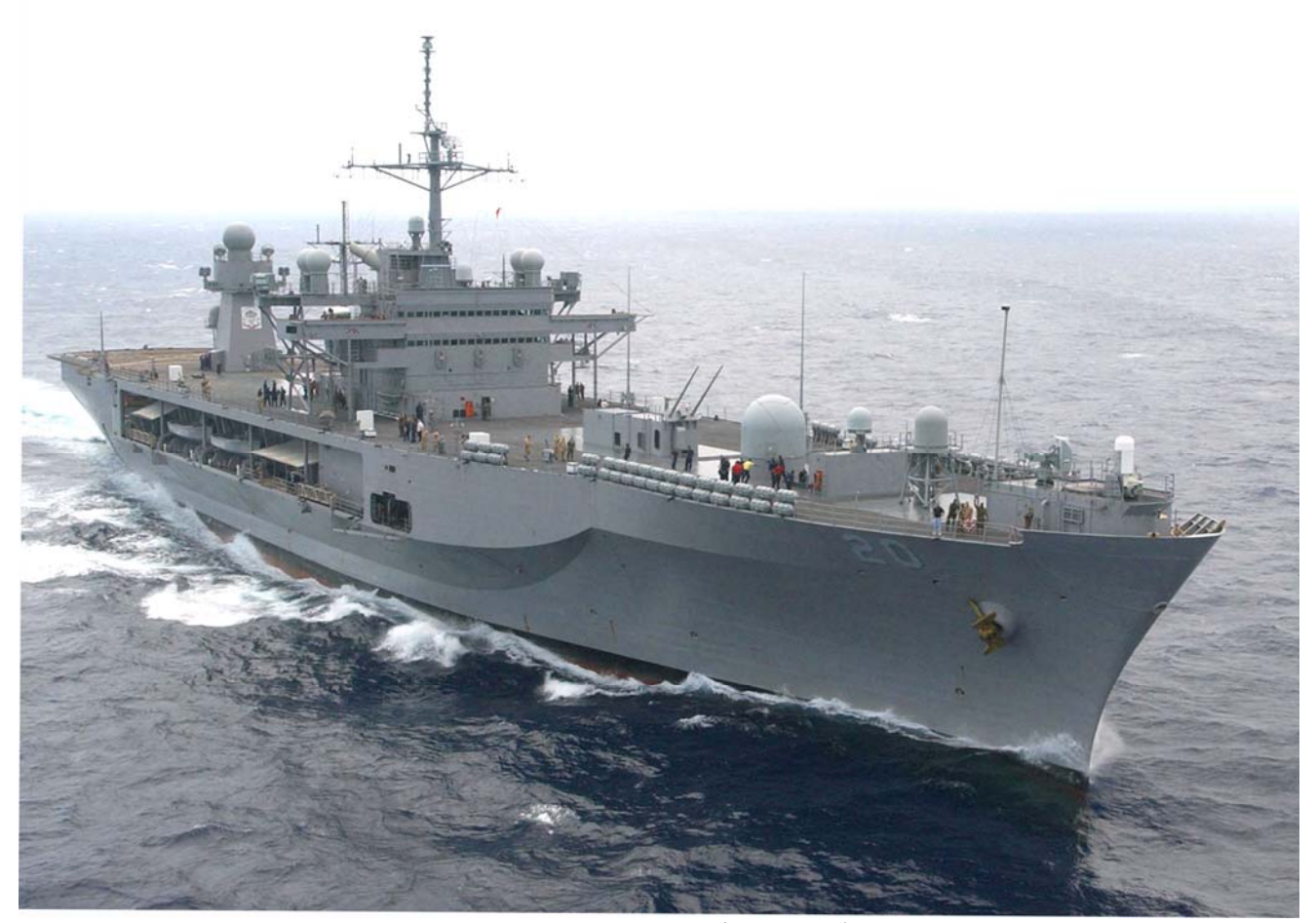
USS Mount Whitnev

Turkish authorities are concerned that the