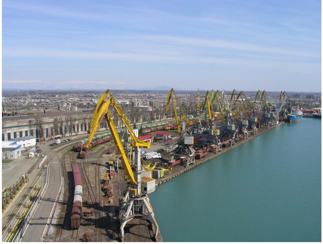
Poti Port

to cite the conflict as a cause. It claimed the decision was based purely on economic reasons, saying that "our experts have carefully studied it and decided that it is not feasible." At the height of the conflict, Kazakhstan suspended oil shipments through Batumi, but flows were restored in early September. The Georgian authorities have not hidden their disappointment, noting that other foreign partners had not stopped their investment projects.