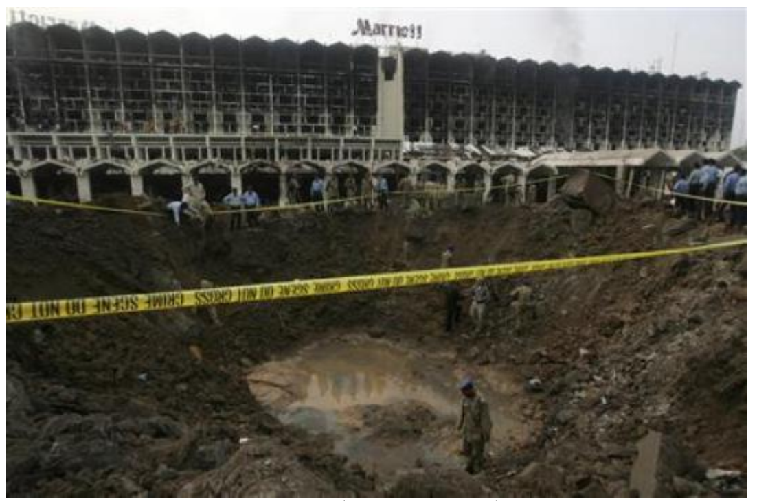
The Islamabad Marriott

Following reports of the American raid in South Waziristan, Army Chief of Staff Gen. Ashfaq Kyani issued a written statement denying that "any agreement or understanding [existed] with the coalition forces" [in Afghanistan] allowing them to strike inside Pakistan." The general pledged to defend Pakistan's sovereignty and territorial integrity "at all cost." Prime Minister Yousaf Raza Gilani said the statement reflected his government's position.