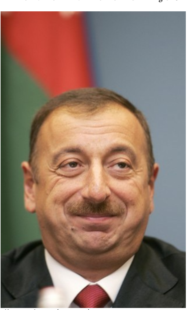
Ilham Aliyev

This is not the first time that the opposition parties are boycotting either the election process, or elections results. In the 1998 Presidential elections, most opposition parties, with the exception of the National Independence Party, stayed out of the election process for similar reasons. Then