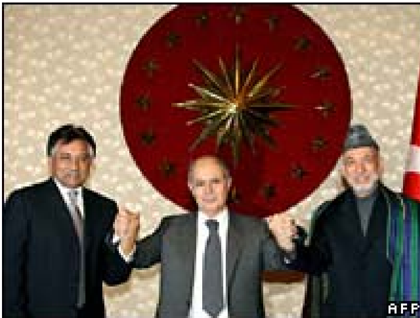
Musharraf, Sezer and Karzai in Ankara.

Pakistan's meddling in Afghanistan's internal affairs, by supporting its surrogate warlords such as Gulbuddin Hekmatyar, ignited a bloody civil war and led to the decisions by other regional countries to intervene in the inter-