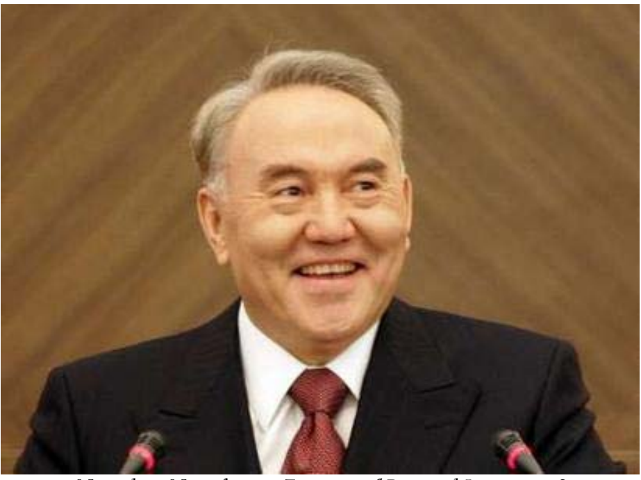
Nursultan Nazarbayev: Engineer of Regional Integration?

desired, often leading to a situation where overexcessive exercise of sovereignty of one regional state damaged the interests of others. Border delimitation and water issues serve as good examples for this. For integration to succeed in Central Asia, it is important for these states to accept that the individual sovereignty of each state should be voluntarily limited and transmuted into "regional sovereignty", under which all problematic issues (ex. inter-state water consumption, others) would become a subject for collective regional decision making. While such a decision-making process shows some signs of emerging, collective actions that deliver on promises and implement