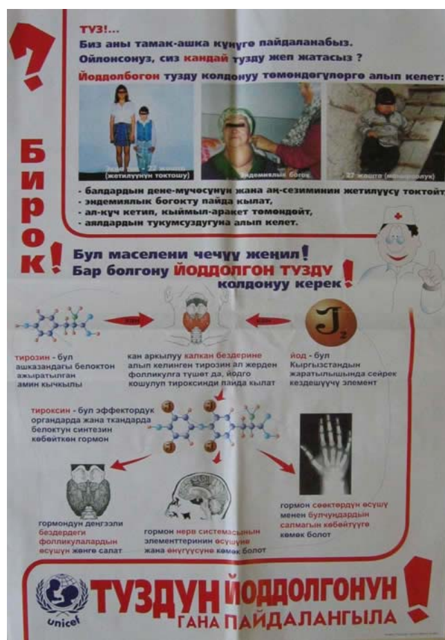
Poster promoting iodized salt.

Likewise, controls have shown great amounts of counterfeit products in shops and markets all over Kyrgyzstan, since fraudulent businesses forge packets of well-known brands. The general economic situation is also mirrored in the salt business, as insufficient self-monitoring by producers and the concealment of real output and sales volume for the purposes of tax evasion remain widespread.