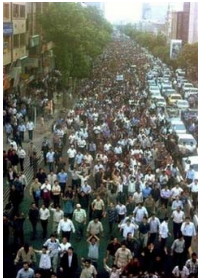
Streets of Tabriz, May 2006

Turks was rejected. Official ideology continues to regard them as turkified Persians, “Aryans” in origin.