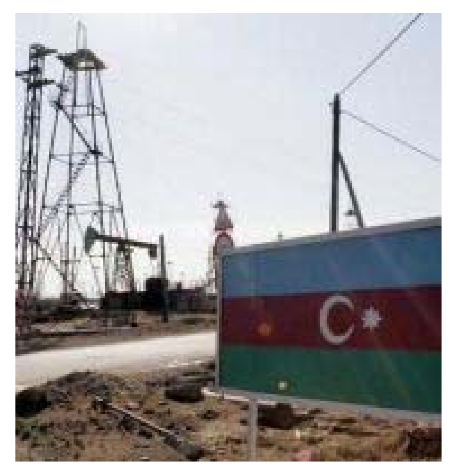
the United States have increased their support for Baku in the negotiations on the Nagorno-Karabakh conflict.

IMPLICATIONS: When he came to power in late 2003, Ilham Aliyev decided to reconsider this energy strategy for the Azerbaijani-Armenian conflict. He first decided to unify the Azerbaijani energy sector so as to further intertwine hydrocarbons development with foreign policy. He appointed young and reliable people to key positions, providing him with unambiguous control over the country's energy policy. SOCAR progressively became the leading company in this sector, notably merging with Azerigaz in 2009 and with Azerkimya in 2010. Presently, it is the strongest actor on the Azerbaijani energy market, controlling the production, transportation and sale of Azerbaijani hydrocarbons resources.