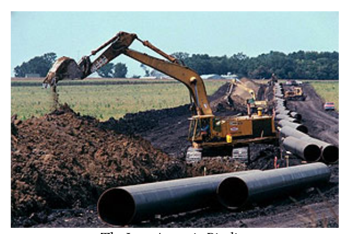
The Iran-Armenia Pipeline

Hrazdan TPP to Gazprom is completed. Among non-governmental Russian companies, Vympelcom is by far the largest single investor in Armenia, as it took 90 percent of the ArmenTel shares of its previous owner, Greece OTE for some Euros 482 million or US$616 million dollars, equivalent to more than 10 percent of Armenia's projected GDP this year. Another large private investor is the Russian aluminum giant Rusal, which owns Armenal, a large foil-producing factory. Rusal in recent years invested 80 million dollars to modernize it.