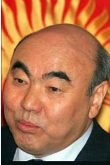
From A to B? Akayev, right, and Bakiyev, left

Yet soon after the first protests were called, Bakiev showed that he too had learned from the color revolutions. The government pushed back to stifle opposition momentum with three key moves. First, it retained control of the media. It declined requests by opposition leaders for airtime on the state TV station, keeping large portions of