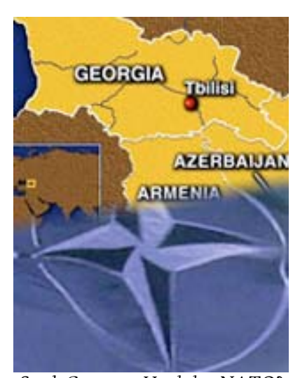
South Caucasus: Headed to NATO?

battalion to the size of a brigade. Armenian deputy Foreign Minister Arman Kirakosian said cooperation with NATO is "one of Armenia's top foreign policy priorities and one of the bases for Armenia's relations with the EU." Armenia seeks