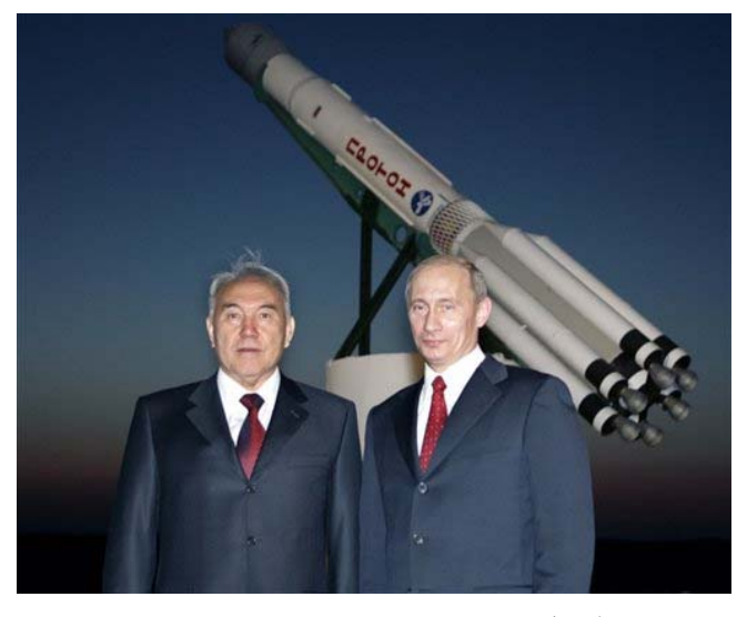
Two presidents at the launching

Kazakhstan's cooperation with the Russian Rosskosmos space agency proved to be more fruitful. The Kazakh government first announced its plans to construct its own commercial telecommunications satellite in 2004, but lacking the adequate technology to construct it, the government had to place an order with Russia's Khrunichev space technology center, while some French space technology companies offered technical assistance in the construction of the satellite.