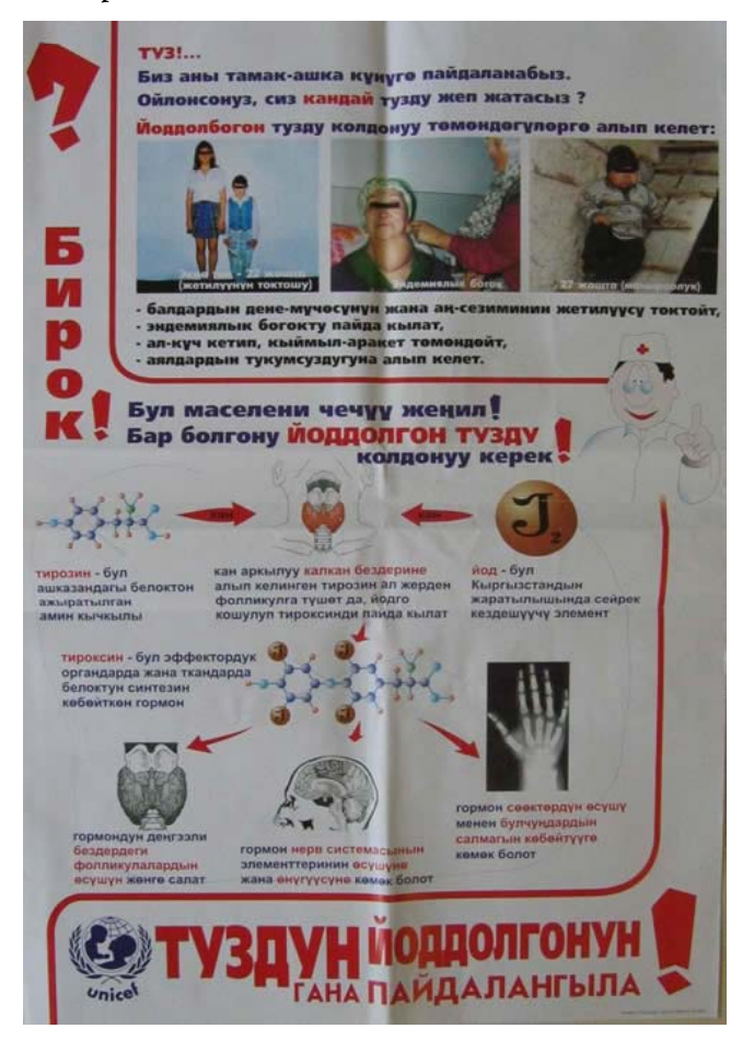
Poster promoting iodized salt. (www.ceecis.org)

Likewise, controls have shown great amounts of counterfeit products in shops and markets all over Kyrgyzstan, since fraudulent businesses forge packets of well-known brands. The general economic situation is also mirrored in the salt business, as insufficient self-monitoring by producers and the concealment of real output and sales volume for the purposes of tax evasion remain widespread.