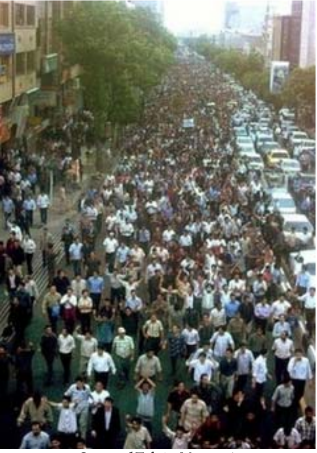
Streets of Tabriz, May 2006

Turks was rejected. Official ideology continues to regard them as turkified Persians, "Aryans" in origin.