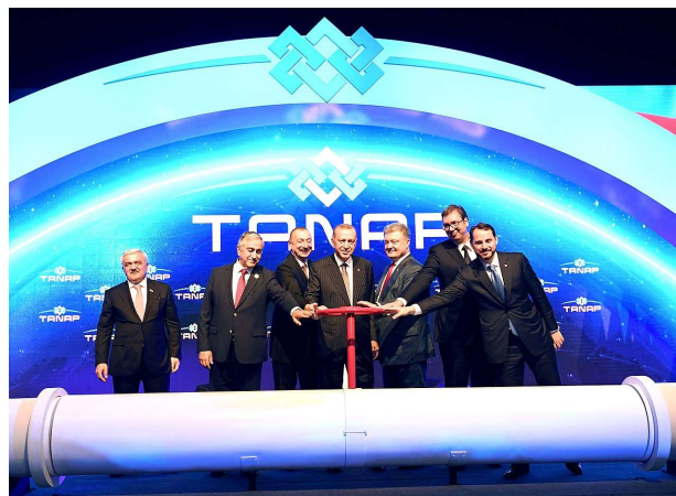
Inauguration of the Trans-Anatolian Pipeline, 2018.

Over the last three decades, Türkiye has played a key role in the establishment of the East-West energy corridor from Azerbaijan to Europe. As a landlocked state, Azerbaijan had to establish its major energy export corridor via neighboring states, and not di-